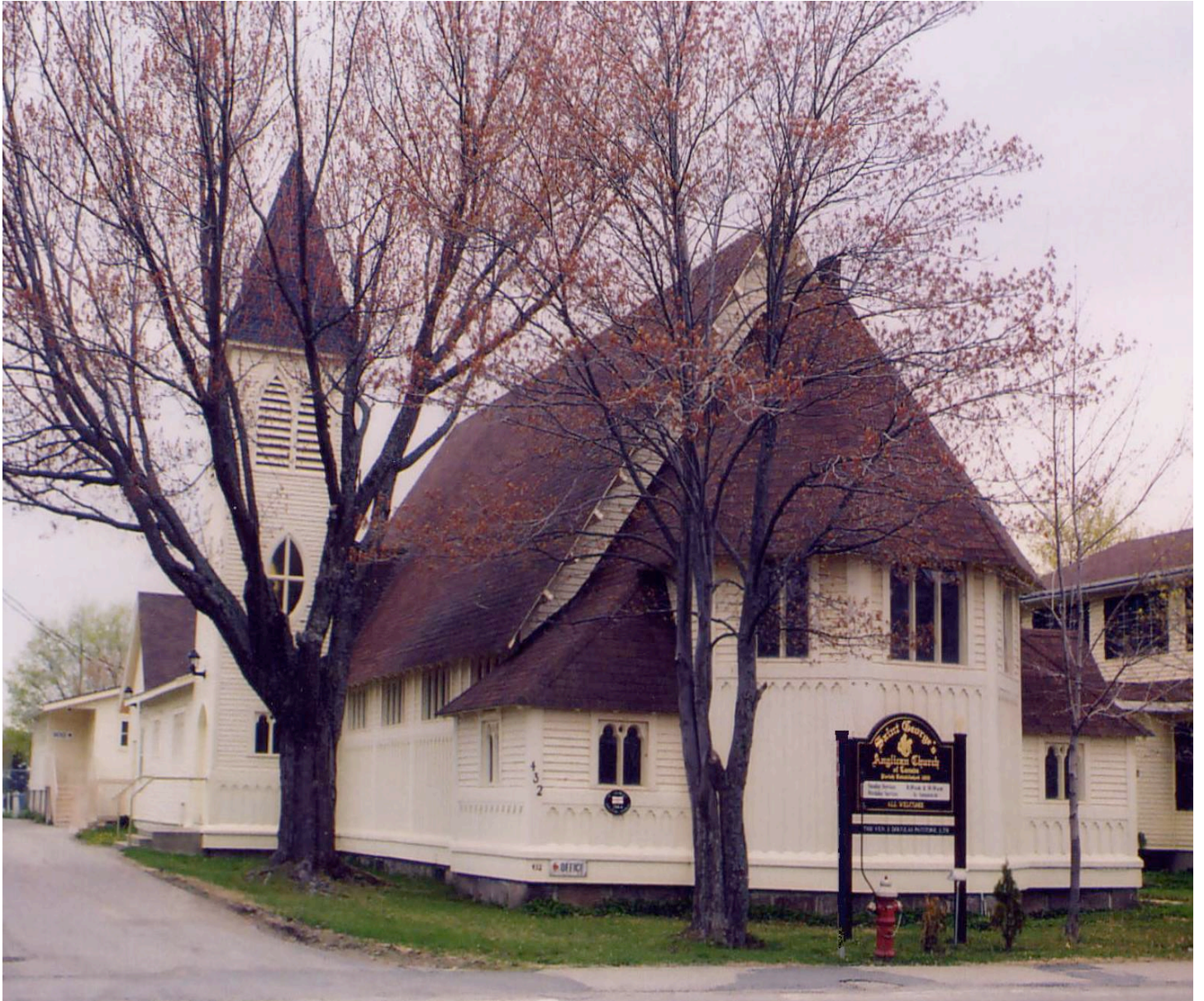
Saint George Anglican Church, Bathurst, N.B.

Theme: “Faith, Fellowship, Fun and Food” read Matthew 5; 6