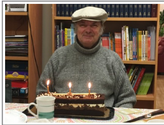
Celebrating a birthday at the Thursday Drop-in

Our Thursday afternoon community Drop-in has been operating since January 2016 with no sign of slowing down. We keep it running all year - the only exception being the week of Christmas. Those who volunteer and those who attend this program have become close friends. From time to time someone new will come needing help or prayer and we've gotten to know a number of people in the city thanks to this open space for the community.