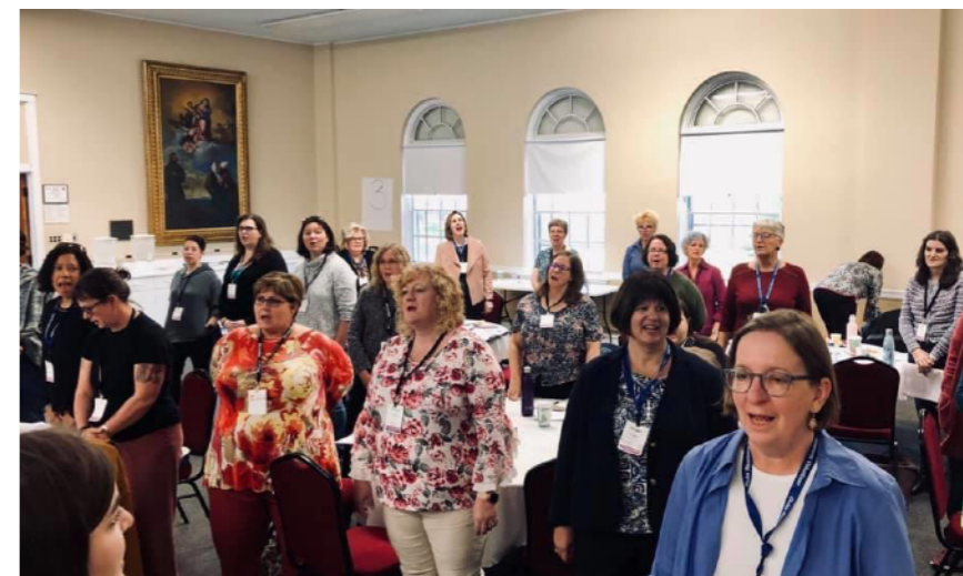
The 2019 Leading Women Conference in Chicago

Just before March break we ran our first Friday Night Supper Club at St. John the Baptist King Edward School. The program gathered families from the school to cook together and eat a meal together. With volunteers from the Anglican and Catholic Church this IARCCUM initiative aims at strengthening the community through building up families. We’ve had to pause this program for now, but hope to return to it in some form.