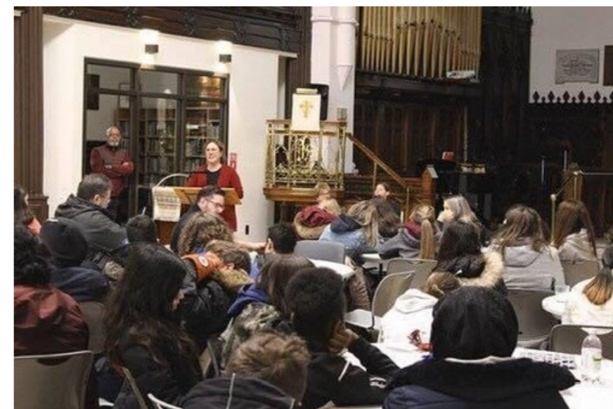
The “Jeunes Leaders en Action” group listening to a presentation from Coverdale at Stone Church.