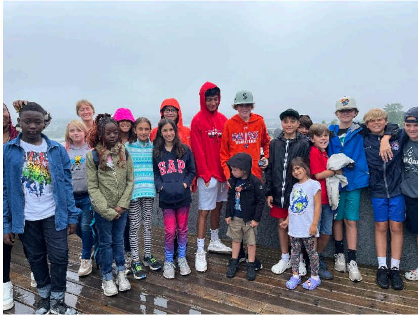
Some of the Kids Lead Participants visiting the roof of the Social Enterprise Hub and a craft they created at Creative Connections.