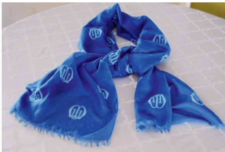
Scarf: Mothers' Union blue with white logos. 27" x 60" (68 cm x 183 cm). Lightweight Viscose. Sourced from Mary Sumner Enterprises.