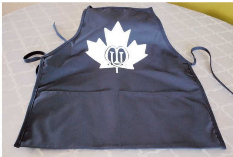
MU Apron: One size fits all. Navy blue apron with 2 deep pockets and the Canadian MU logo in white.