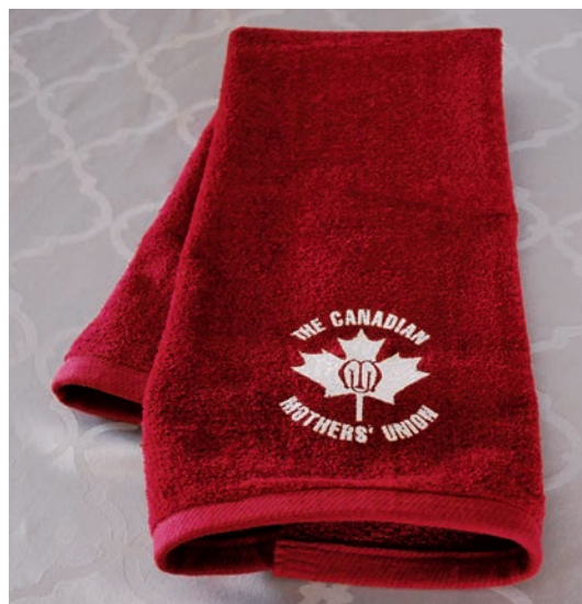
MU Hand Towel: 17" x 26" (42 cm x 66 cm). Lovely burgundy hand towel with the Canadian MU logo in white.