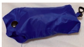
Reusable Nylon Shopping Bag: Opens to 16" x 15-1/2" x 5", (40.6 x 39 x 12.7 cm). Folds to store in pouch that is 5" x 2-1/2" x 1", (12.7 x 63 x 25 cm).