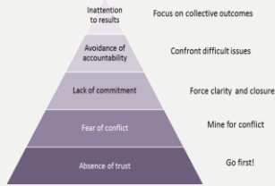
The Five Dysfunctions of a Team – Patrick Lencioni