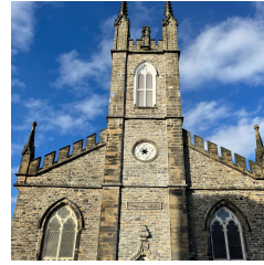
STONE CHURCH PARTNERSHIPS