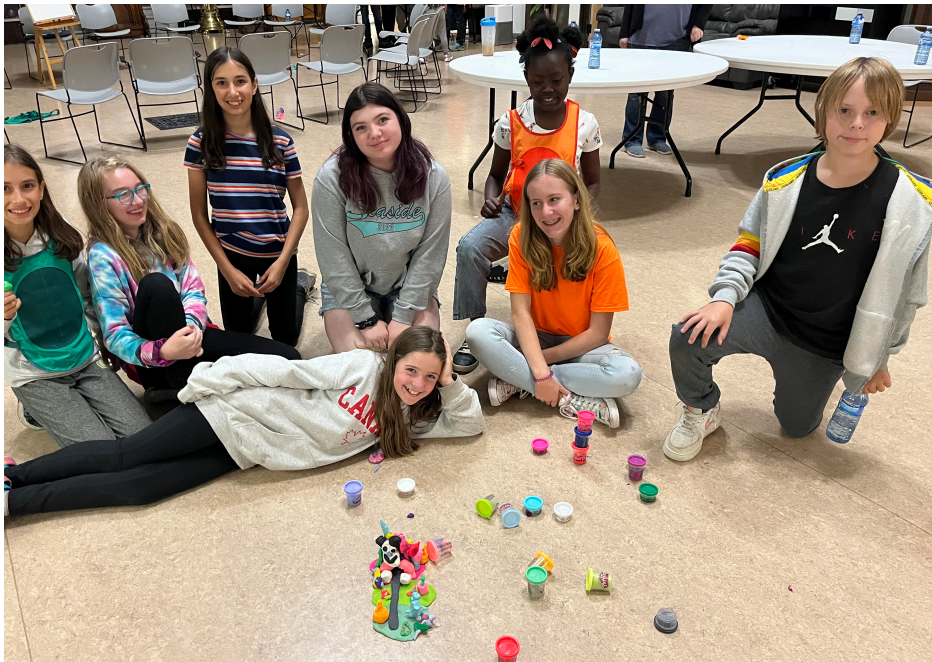
Pictured here: some of the kids from Youth Connection - our weekly Youth group that we run with Inner City Youth Ministry.

Financial details such as budget and expenditure information is available upon request.